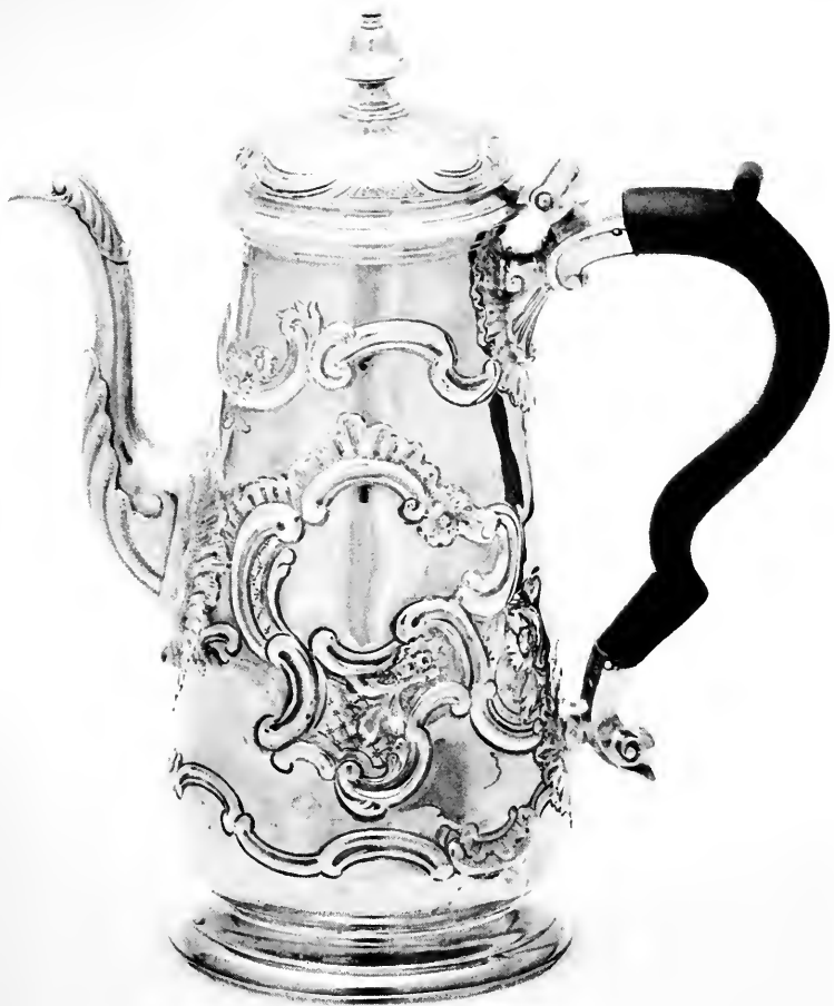
Coffee pot by Alexander Petrie; silver; Charleston, S.C.; 1742–1768. HOA 10 \frac{3}{8} ". MESDA acc. 3996.